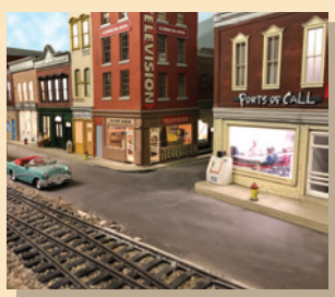
Located at 11 Curity Avenue (Off O'Connor Drive, east of St. Clair Avenue East)